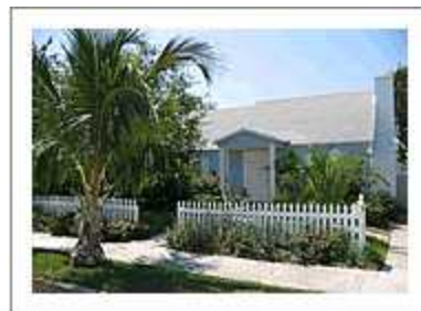
The Coco Palm

Amenities for both vacation rentals include: Central air and heat; a fully equipped gourmet kitchen w/ coffee maker, microwave, blender, spices, cookware, etc; cable television with DVD; high speed internet access; bed linens/bath towels; washer/dryer; hair dryer; iron/board; cell phone w/ unlimited local calls; private fenced backyard; outdoor grill; outdoor seating; beach towels; infant crib; bicycles, private pool or pool access.