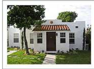
The Casa Blanca

Relax in the tranquility of your own private romantic cottage vacation home! Both vacation rentals are historically designated and are located in the heart of the Grandview Heights Historic Neighborhood of West Palm Beach, Florida, adjacent to the Grandview Gardens Bed & Breakfast.